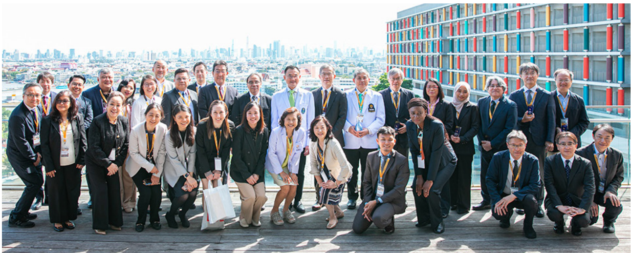
Participants attending the 3 rd ARISE Annual Meeting in Bangkok, Thailand.