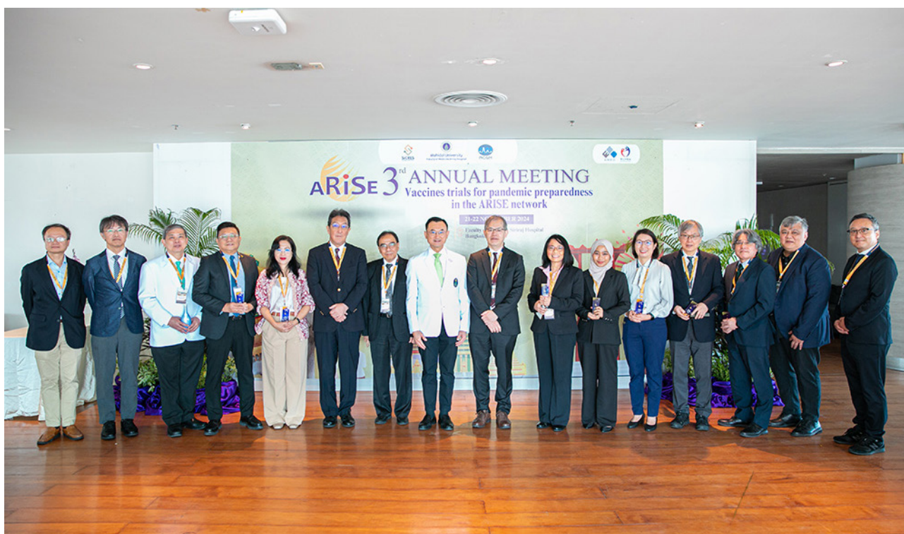
Steering Committee members gathered for the 3 rd ARISE Annual Meeting in Bangkok, Thailand.

The Steering Committee members meet in person once a year to discuss important issues and determine the direction of the network.